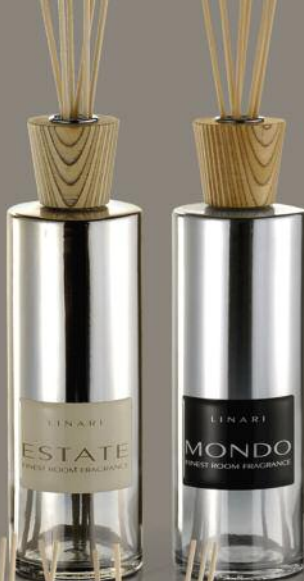
CHROME SHADOW LINE